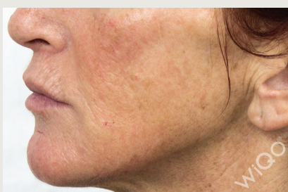
After 5 sessions on a weekly basis