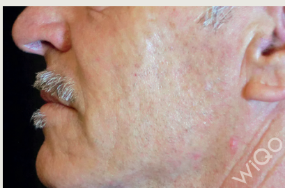
After 4 sessions on a weekly basis