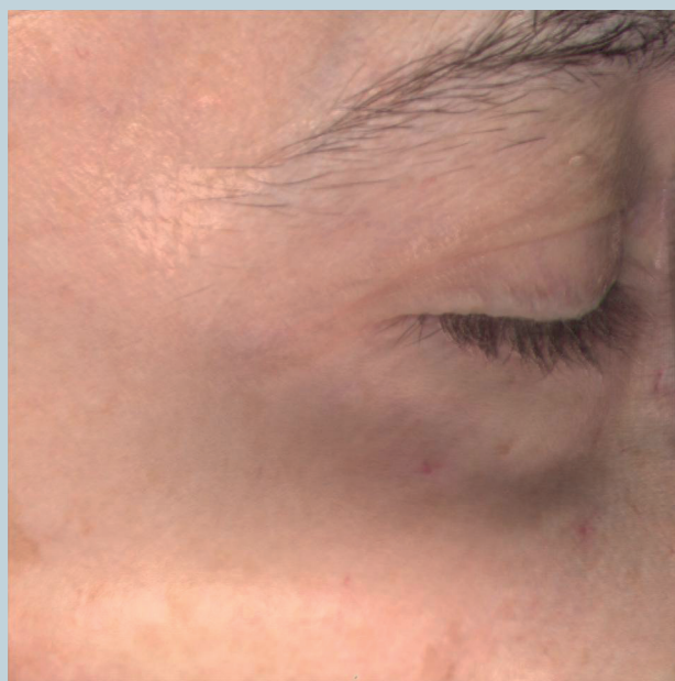
After 4 weeks